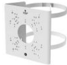
MS-7CBK627D Pole Mount